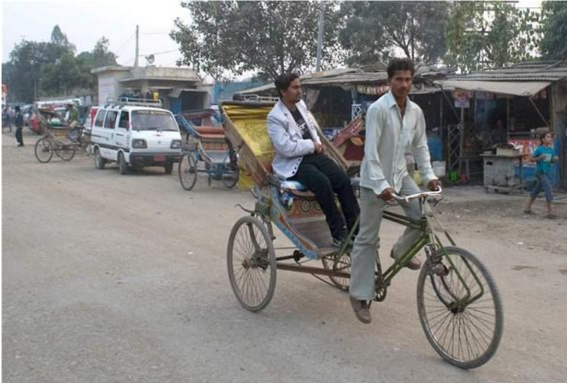
Figure1.Plight of rickshaw puller