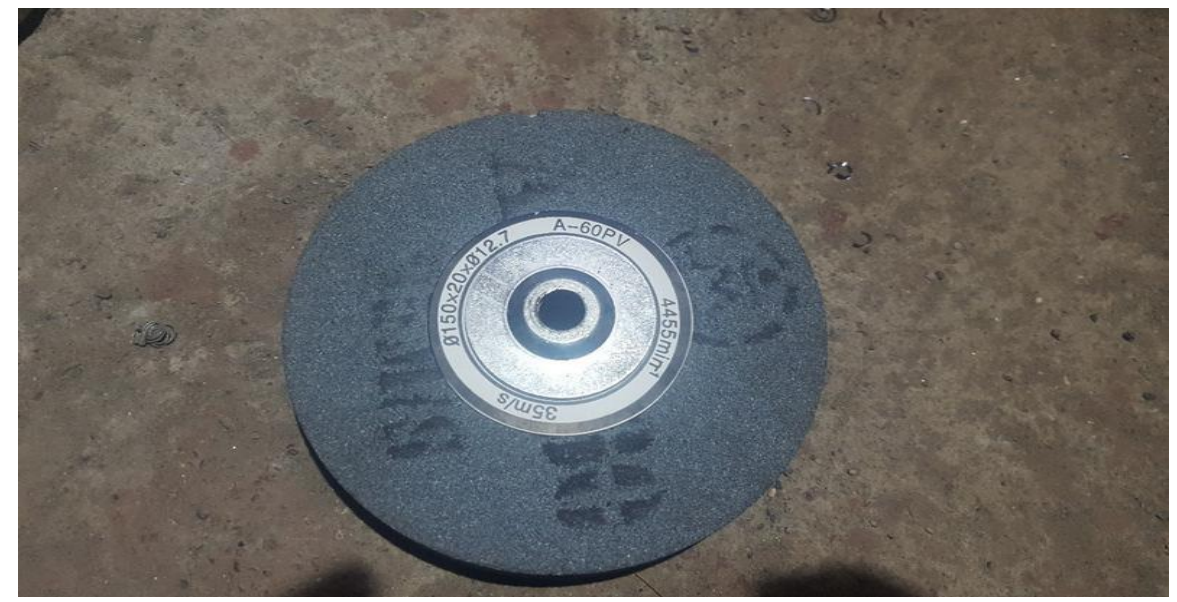
Figuree 1 shows Grinding wheel used in the Attachment