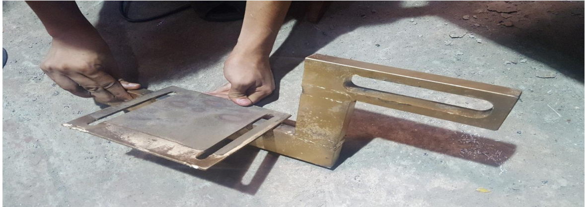
Figure 4 shows Base plate and Frame used in the attachment

This serves as the foundation for the machine or attachment. It should be string rigid and should be accurate and precise in dimensions. The material selected is Mild Steel. The base plate is welded on the Frame.