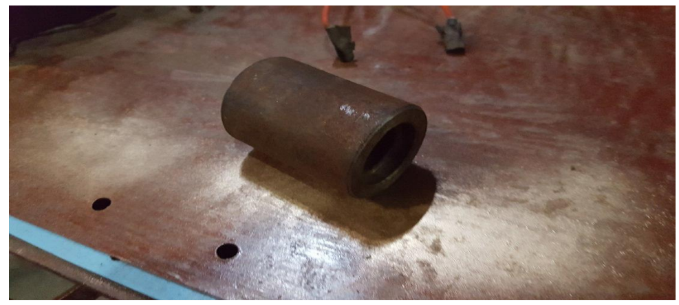
Figure 5 shows sleeve used in the attachment

The sleeves are made of mild steel. They are 1 in number. This should be accurate and precise in dimensions. They are turned on lathe and drilled.