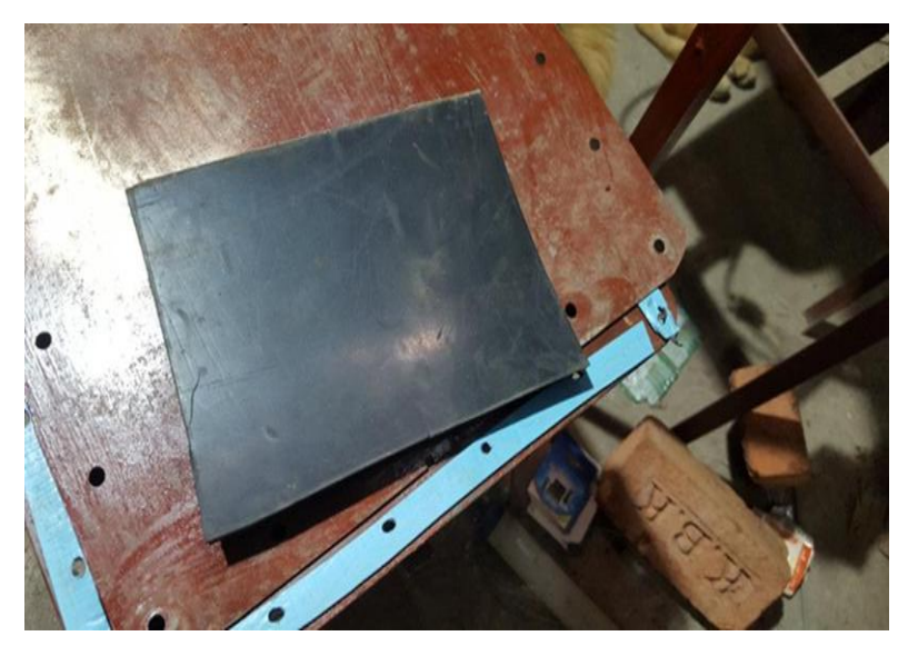
Figure 6 shows Damper used in the attachment