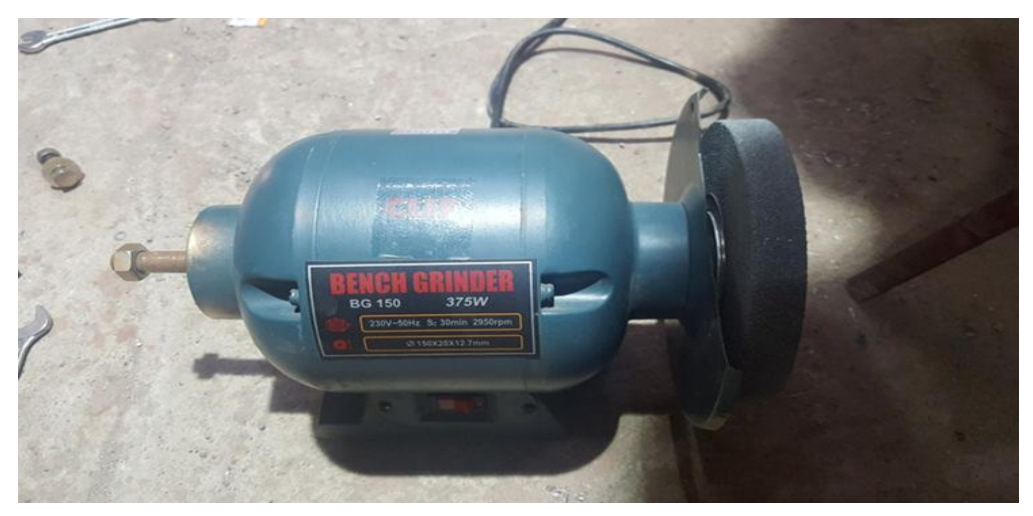
Figure 2 shows Motor used in the attachment

AC motor, RPM-2950, Power 1 H.P., Frequency-50Hz, Voltage-415 V, current 1.8 Amps