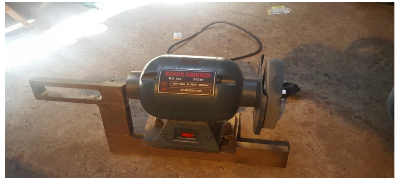
Figure 7 shows Final Layout

The layout is very compact and it can easily mount on lathe by removing check post. The motor is mounted on the attachment, fitted on the cross slide. The final layout is shown below.