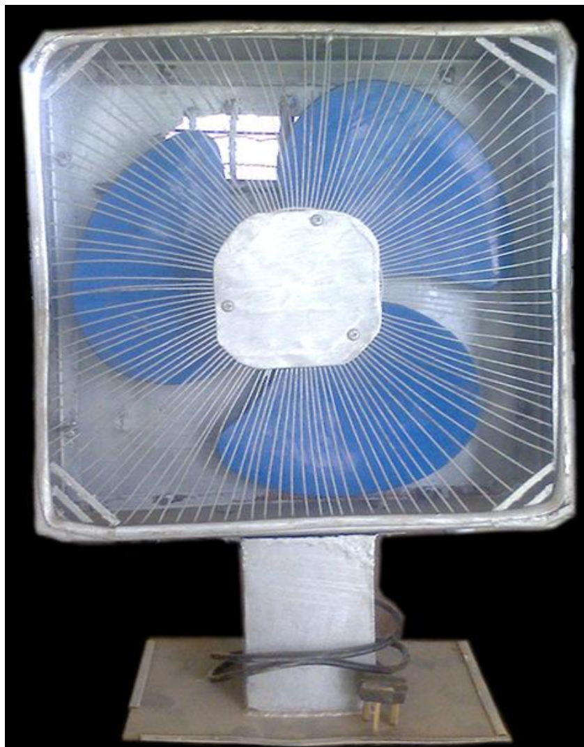
Figure 3: Prototype of the Developed Rechargeable Electric Fan