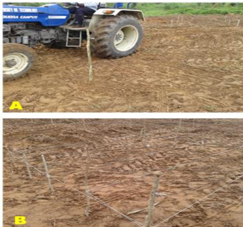
Figure 1: (A) Compaction of plots by tractor and (B) marking of compacted plots prior to planting