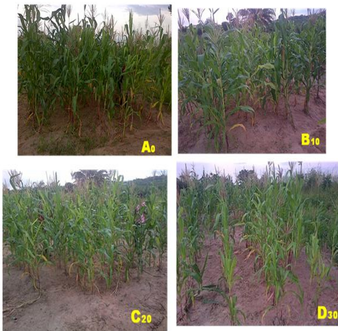
Figure 4: Growth of Maize at 8 WAP According to Treatments Operation ( A_0 , B_{10} , C_{20} and D_{30} )