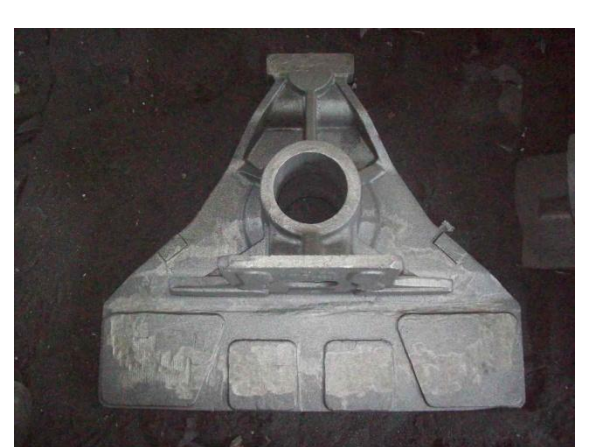
Figure 2 Photograph of TSB Casting