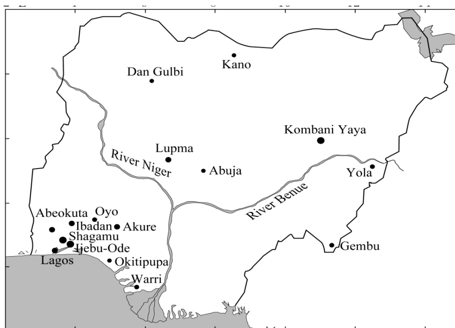
Fig. 1 Map of Nigeria showing the areas where some earth tremors were felt (diameter of the solid dot denotes intensity of the events, after Akpan and Yakubu, 2010), not drawn to scale

Historical and recent seismicity data do indicate that disastrous earthquakes have occurred in other parts of Africa far away from the Atlas Mountain region and also in the areas far from the rift valley system (Onuoha, 1988). This development indicates that Nigeria and indeed some West African countries are likely to witness devastating earthquakes in future. This is in line with recent review of earthquake occurrences and observations in Nigeria which shows several minor tremors had been experienced in some parts of the country in 1933, 1939, 1964, 1984, 1990, 1994, 1997, 2000 and 2006 (Akpan and Yakubu, 2010) (Table 1). The intensities of these events ranged from III to VI based on the modified Mercalli Intensity Scale. Of these events, only the 1984, 1990, 1994 and 2000 events were instrumentally recorded. They had magnitudes ranging from 4.3 to 4.5 (Akpan and Yakubu, 2010). Just recently at 03:10 GMT on September 11, 2009, an earth tremor occurred in Allada, Benin Republic. This earthquake was felt in some parts of South-western Nigeria (Akpan and Yakubu, 2010).