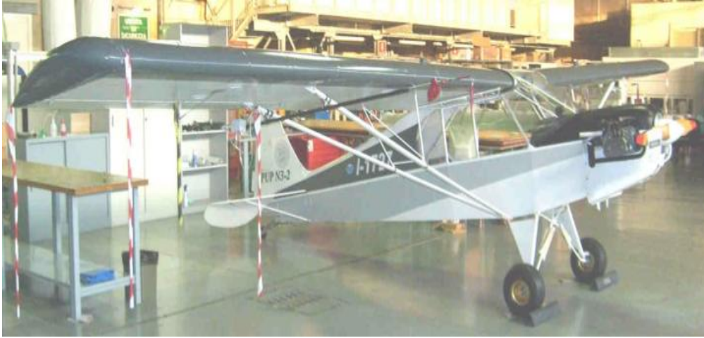
Fig. 1 Flight Research Laboratory L.A.U.R.A.