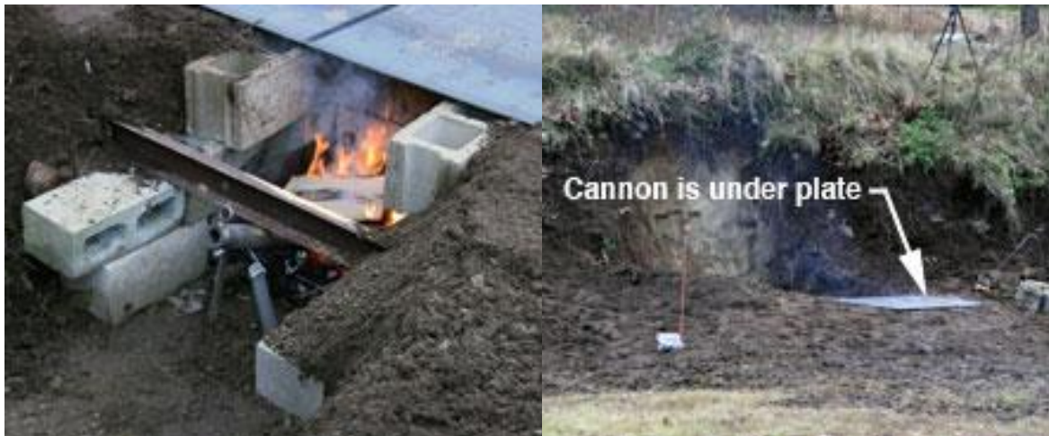
Figure 3. File picture

They observed the firings, which were aimed at a sand berm, on remote monitors, behind a hill, 150 feet away from the cannon. Two rounds were fired from the cannon, with the time to reload the cannon being close to 2 minutes. The muzzle velocity observed from a high speed camera was over 300m/s (approx. 630 mph). The shells kinetic energy was calculated to be approximately 23 KJ - which is 1.3 to 1.8 times the energy of a 0.50 BMG caliber bullet fired from a M2 machine gun (a comparison made by the ArchiMIT's). Now with this data, we are safe to say that Archimedes isn't wrong.[11]