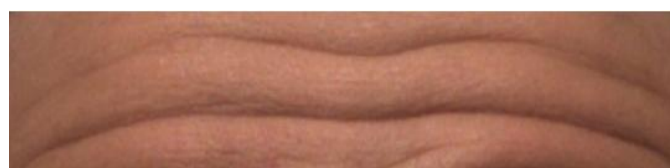
Fig 2: Examples of the forehead wrinkle.