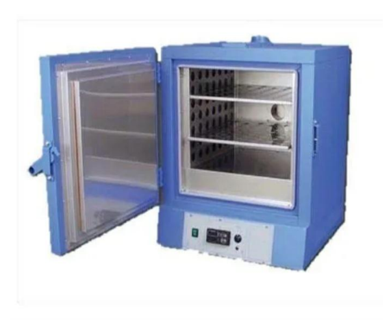
Fig. No 1 Hot air oven

The hot air oven is based on the dry heat Sterilization principle. due to the fact that dry heat Sterilizations rely on conduction, the temperature of the object to be sterilized initially contacts it's surface before progressively descending to it's inside. Dry heat Sterilization ensure that the entire material sterilized as a result, the material then receives an even distribution of heat and if this heat is used for a predetermined period of time, it aids in the Sterilization of all types of microorganisms, including bacteria, viruses, fungus and even resistant end spores, which resist the majority of Sterilization method, dry heat Sterilization the material by causing the particles inside it to oxidize and damage their primary components, ultimately causing the organism to die, for effective Sterilization the temperature is typically set for an hour or so, since hot air is lighter than cold air, thus increasing the temperature inside the chamber results in the flow of hot air up to the roof of the chamber while cold air comes down. Thus, it facilitates the circulation of hot air inside the chamber.(4)