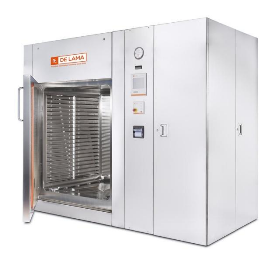
Fig.4 Static air hot air oven.

Static air hot air oven work on the convention governing the law of gravity. The air inside the chamber is heated by hot air produced by a heating coil at the chamber's base. The air then drifts downward on whatever you are sterilising after rising to the top of the chamber. Static air sterilisers take longer to sanitise objects because the chamber needs time to heat up before the procedure can start. Additionally, it takes more time to get to the correct temperature. The temperature is not uniform throughout the oven because heat is not circulated as it is in forced-air ovens.(10)