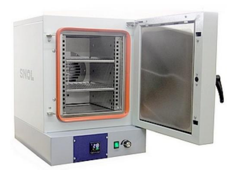
Fig. No 2 forced air Hot air oven

work with the conduction principle. These sterilisers operate by preheating the oven and circulating hot air with a fan. With this sterilising technique, the cooler air is kept at the bottom of the oven and the hot air is kept from rising to the top. The fan ensures that the oven's hot air circulates throughout at a constant temperature. The item that needs to be sterilised is exposed to pressurised hot air. By sending energy through it, this destroys the bacteria that are present on the object. Because it evenly distributes the heat load on the item you are sterilising, this method of dry heat sterilization is frequently favoured. Static air hot air ovens are generally thought to be less effective than the forced air hot air oven.