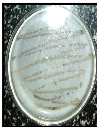
Growth of Azatobacter