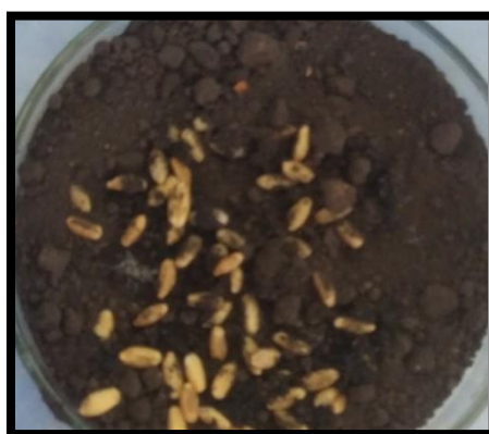
Treatment of seeds with Azatobacter sp.

The initial microbial density was measured using spectrophotometer which is indicated in Table 3. All the seeds were treated with 10 ml of pure microbial biomass except for the control which had treated with 10ml pure water.