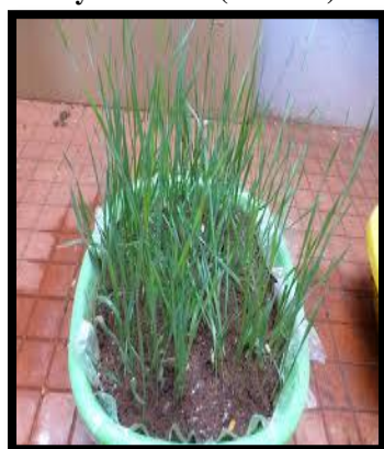
70 days after (Treated)