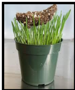
40 days after (Control)