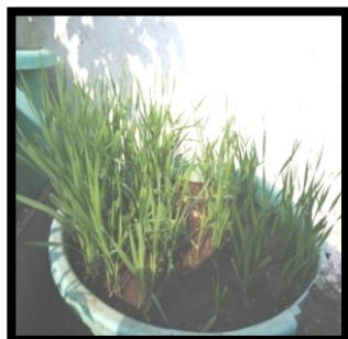
15 days after (Treated)

Accordingly, treatment of Triticum astivum seed with 10 ml of microbial biomass from Azatobacter isolate have enhanced the root length and the shoot length and number of leaves over water treated control, recorded after 70 days of seed germination.