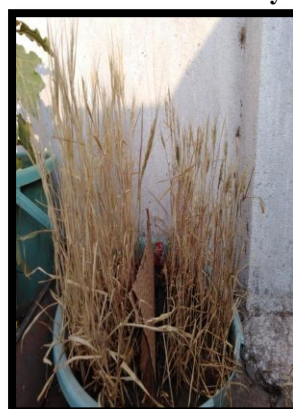
At the time of harvest

The results of this investigation are reliable with earlier examinations (Rajpoot and Panwar, 2013). The results of the current investigation showed that Azatobacter treatment of Triticum astivum plant seeds showed increased plant growth (root and shoot length). By reducing the input and impact of the dangerous chemical fertilizer in the field, the nitrogen fixation process used by soil microorganisms that naturally occur in the soil plays a significant role. Additionally, it has a favorable effect on the development of sustainable agriculture, particularly in nations like Ethiopia where agriculture plays a significant role in the national economy.