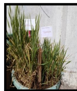
40 days after