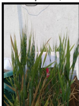
70 days after (Treated)