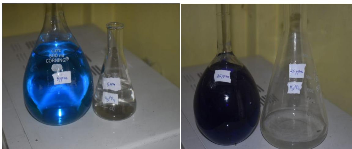
Fig 2: Images of methylene blue dye solution of different concentration: (a)5mg/L, (b)25 mg/L.(Before and after adding adsorbent).