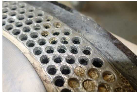
Fig. 7 Uniform abrasive wear of flat die surface