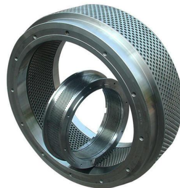
Fig. 2 Design of ring pelleting dies

The design of the pressing rolls varies depending on the manufacturer, the design of the machine, the power of the machine, or the type of pressed raw material. In general, these are rollers rotating freely at the end of an embossed support shaft. It should be emphasized that a minimum gap is set between the rolls and the die to prevent metal contact. The rotation of the rolls occurs only under the effect of friction due to the filling of the pressed material between the die and the rolls. The rotation of the cylinder on the shaft at high radial loads is ensured by a pair of tapered or barrel bearings.