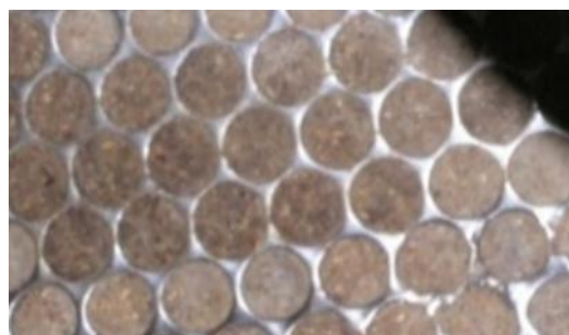
Fig. 12 Wear of the die surface by “honeycombing”

This apt name – honeycombing – belongs to the result of abrasive wear of the die, when the pressed raw material evenly wears the entrance part of the pressing chambers on the front surface of the die (Fig. 12). This type of wear can result in a serious reduction in the thickness of the die support material between the pressing chambers and its subsequent cracking. The formation of honeycomb in a fine form on the surface of the die is a sign of a quality die and is characteristic of a material with a high chromium content.