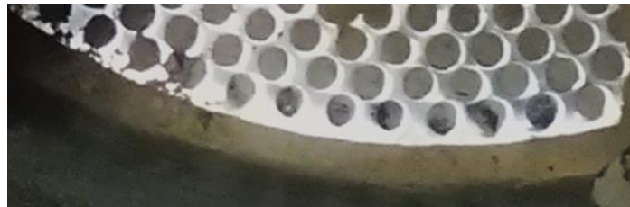
Fig. 11 Wear of the die surface by rollover

Rollover is the condition of the die face when the inlet parts of the pressing chambers begin to close by rollover (Fig. 11). This condition has serious impacts on both pellet quality and throughput of the die, usually lowering both. Rollover is caused when the force acting on the face of the die exceeds the toughness of its material. Roller adjustment and certain types of row material exert excessive stresses on the die face, initiating rollover. [22] The probability of occurrence of this type of die failure increases with increasing surface wear depth for dies with only a surface hardened layer (alloy steel dies).