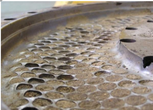
Fig. 6 Deep wear of the die surface

The most noticeable and important trait of any worn die is the depth of the surface wear. The depth of surface wear is defined as the perpendicular distance to the die face from the horizontal plane that marked the original die face surface. Wear depth values are measured at three locations in the transverse direction of the die – in the exact center of the working surface of the die and in the third rows of chambers from each side. The only exception is the existence of an extremely deep wear band, in which case the measurement would be made at the deepest point. The depth of wear measurement gives important information concerning feed distribution by evaluating which portion of the ring die is worn the deepest. This measurement can also identify worn wipers and deflectors, as well as unevenly worn pressing rolls. [22] The surface wear of the pressing tools is shown in Figures 6 to 10.