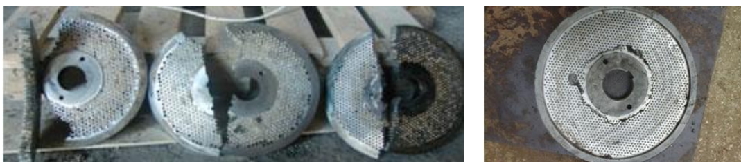
Fig. 14 Damage to the flat die by fatigue fracture [23]

The pelleting die is a tool whose construction is weakened by a number of pressing chambers. It performs its function in adverse conditions, under the influence of high force loading by pressing rolls, under the influence of frictional forces both on the surface of the die and inside the pressing chambers, and all this in a corrosive environment at a raised working temperature. However, it is not the high pressing pressure that reduces its service life, but primarily material fatigue. The die is loaded with an alternating load due to the rolling of the pressing rolls, which leads to a fatigue fracture (Fig. 14). This failure can be partially prevented already during the design of the die. In the case of flat die, it is advisable to increase its thickness. In view of the stress curve of ring dies, increasing not only the thickness and width, but also the diameter of the die helps. These design changes can improve die bending resistance and manufacturing efficiency. If the dimensions of the die are unchanged, its strength can be positively influenced by changing the drilling pattern of the pressing chambers or by appropriate heat treatment.