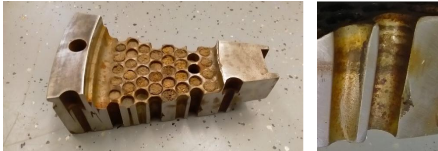
Fig. 13 Damage to the pressing channels of the die by pitting

Scoring has the appearance of longitudinal lines on the inner surface of the pressing chambers [22]. These grooves are caused by highly abrasive pelletized raw materials, which damage its surface when passing through the chamber. Very often scoring occurs as a result of previous pitting. Then it has the shape of a comet, the origin is a pit and the tail is caused by scoring. Heavy scoring reduces the permeability of the die and decreases the quality of the pellets.