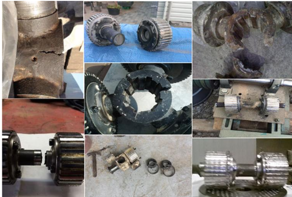
Fig. 16 Different types of wear and damage to the pressing rolls [23]

Just like the pelleting die, the pressing rolls are subject to high force loads, friction and alternating loads. These factors result from normal wear of shells, through abnormal uneven wear, to fatigue fracture of shafts or bushings and hubs (Fig. 16).