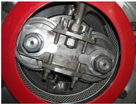
Fig. 4 Pressing rolls arrangement of ring die pelleting press

In the case of pelleting machines with ring die, the number of pressing rolls is usually two to three (Fig. 4 and Fig. 5). Three rollers are usually used for high-performance presses and large die diameters. The design of the bearing is more complicated. An eccentric is mounted at the free end of the support shaft to define the exact relative position of the roll and die. At the eccentric, there are a pair of bearings inserted into the working shell of a hollow cylinder. [20]