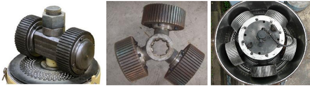
Fig. 3 Pressing rolls arrangement of flat die pelleting machine

In the case of pelleting machines with ring die, the number of pressing rolls is usually two to three (Fig. 4 and Fig. 5). Three rollers are usually used for high-performance presses and large die diameters. The design of the bearing is more complicated. An eccentric is mounted at the free end of the support shaft to define the exact relative position of the roll and die. At the eccentric, there are a pair of bearings inserted into the working shell of a hollow cylinder. [20]