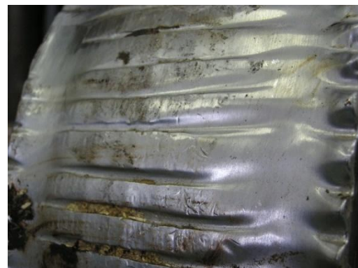
Fig. 9 Detail of deep wear of the grooved working surface of the roll