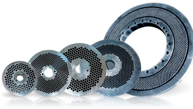
Fig. 1 Design of flat pelleting dies

Ring dies (Fig. 2) are characterized by a much more complex construction, larger dimensions and weight, which also results in high production costs. Nevertheless, they are much more represented in practice due to their high hourly outputs with lower energy consumption compared to flat dies, they have high strength, less wear and longer service life due to the principle of tool kinematics. In order to better understand the differences between these types of dies, it is necessary to explain in detail the working principle and kinematics of individual structures.