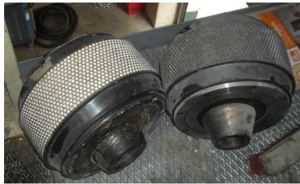
Fig. 5 Construction of pressing rolls of the ring die pelleting press

The work surface of the rolls that comes into contact with the pressed raw material must have a specific "tread" geometry in order to effectively pull the raw material under the roll and press it and extrude it through the die. There are many patterns and configurations of the outer shell of the rolls, their use differs from the type of pelleted material and the manufacturer. The tread pattern can be wavy with open or closed end grooves, wavy spiral, hole, protrusion, combined, etc.