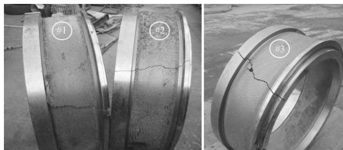
Fig. 15 Damage to the ring die by fatigue fracture [14]