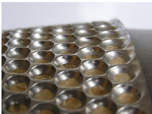
Fig. 8 Detail of the wear of the perforated surface of the pressing rolls