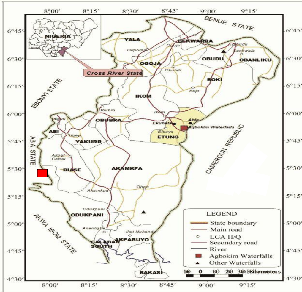
Figure 1: Map of Cross River State, showing the location of Ugep Urban