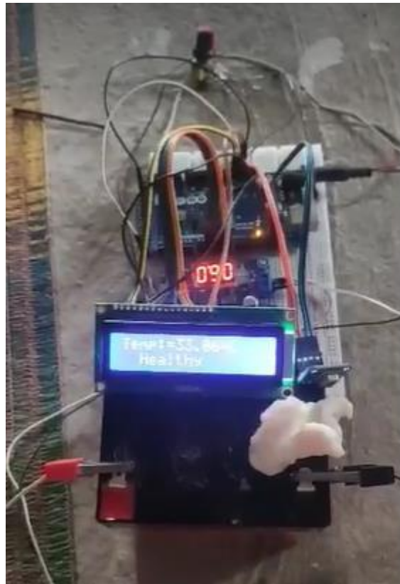
Figure 3: Project Implementation