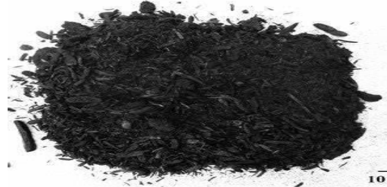
Cement Bagasse Ash