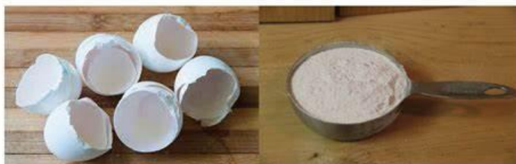
Figure 1. Egg shell and Egg shell powder.