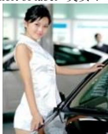
Fig. 1. One image example with label “性感车模” (Sexy auto model)

Generally, these two aspects together construct the so-called semantic map between target resources and users' initiatives, as shown as Path 3 in Fig 2. Ideally, we hope the query can directly be matched by some resources, like Path 3, but we are not always so fortunate in real world. Two possible options to solve the problem: